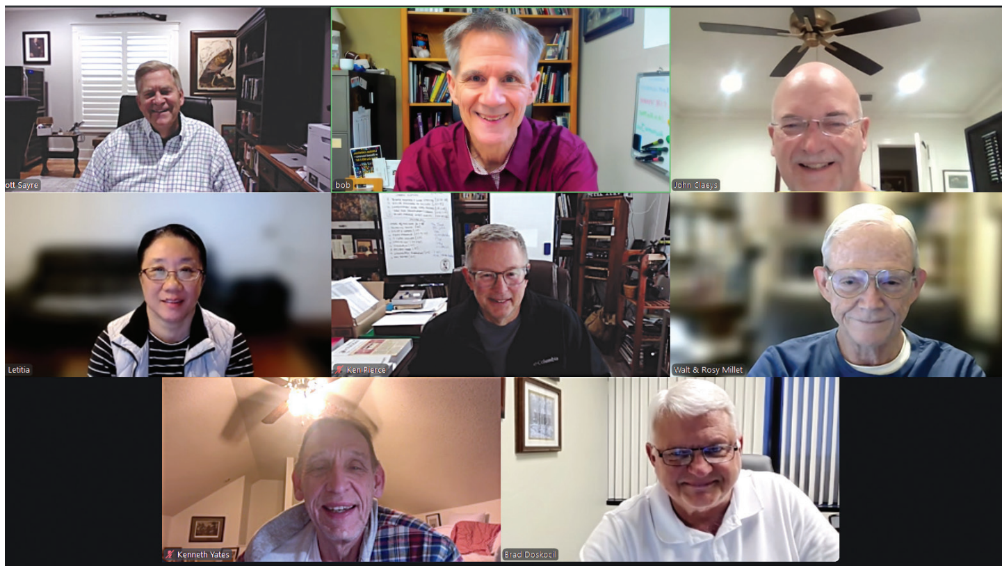
December 17 Board Meeting