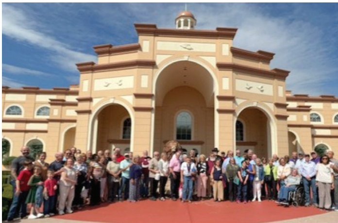
The whole group outside the Sights and Sounds theater