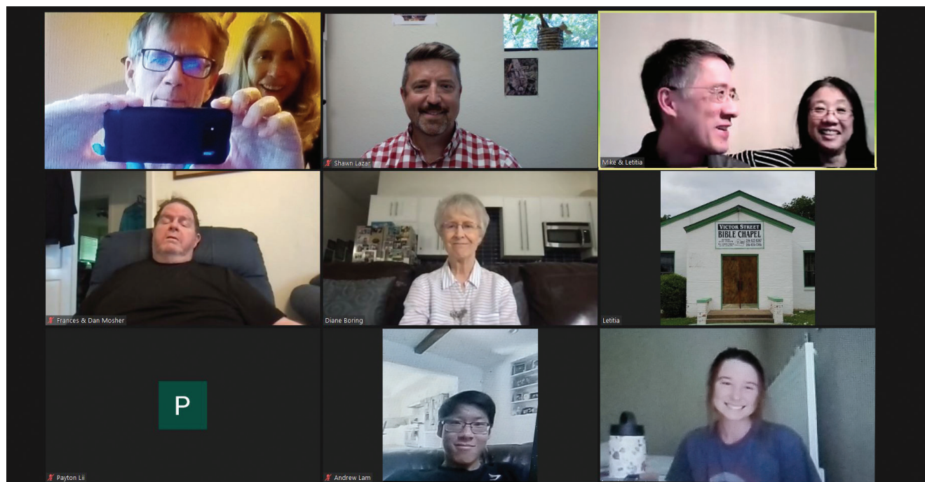
Victor Street Bible Chapel College Class