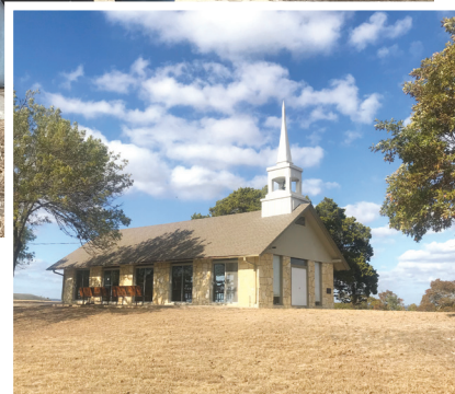
The chapel where classes are held.

It is encouraging during the partial lockdown of our nation to be able to speak for the Lord and visit with His people.