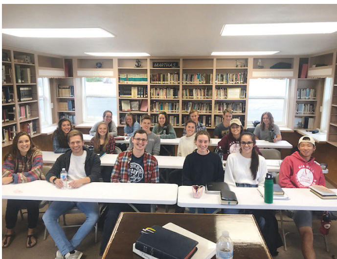
Second year students at His Hill.