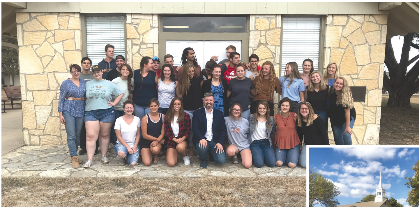
First year students at His Hill.