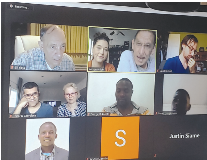
Zooming in Zambia!