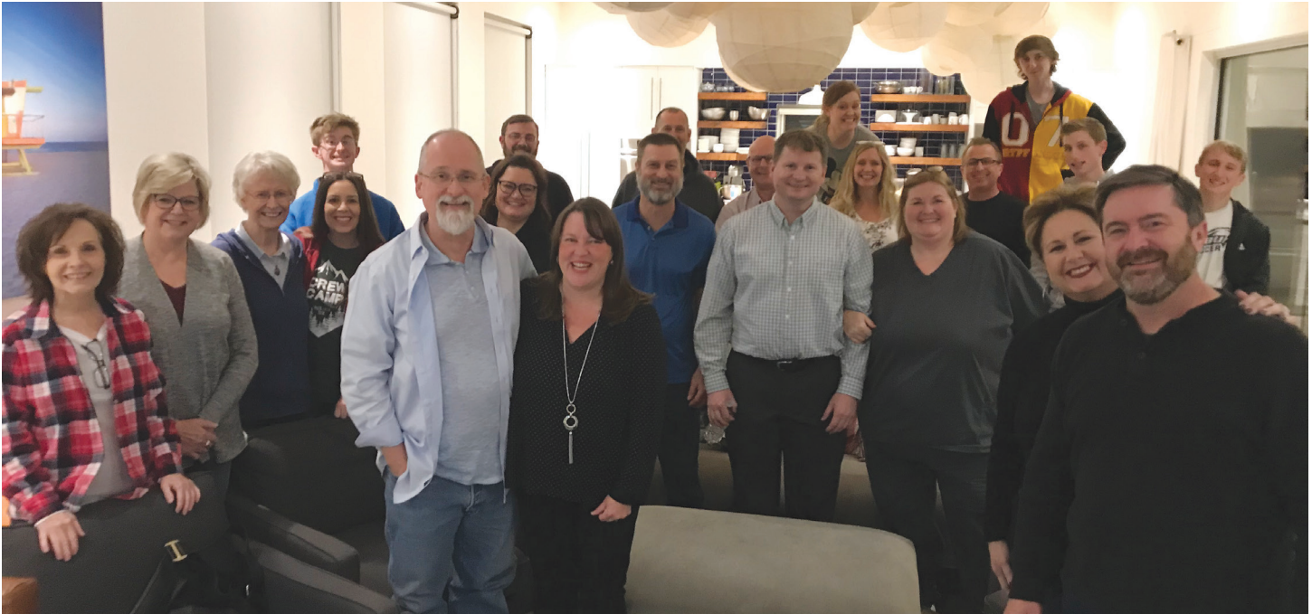
A warm welcome in Northwest Arkansas!