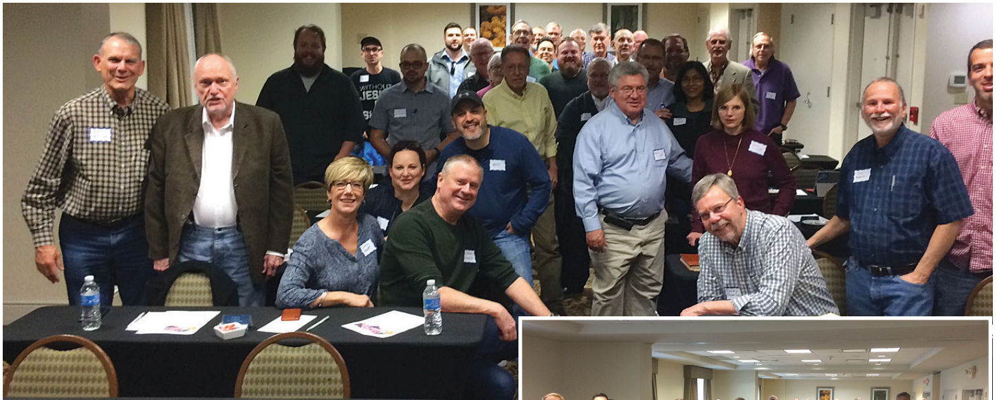
Houston Regional on Friday