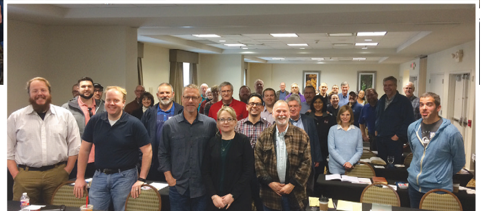
Houston on Saturday

Audio from the conference should be available on the website by the end of the month.