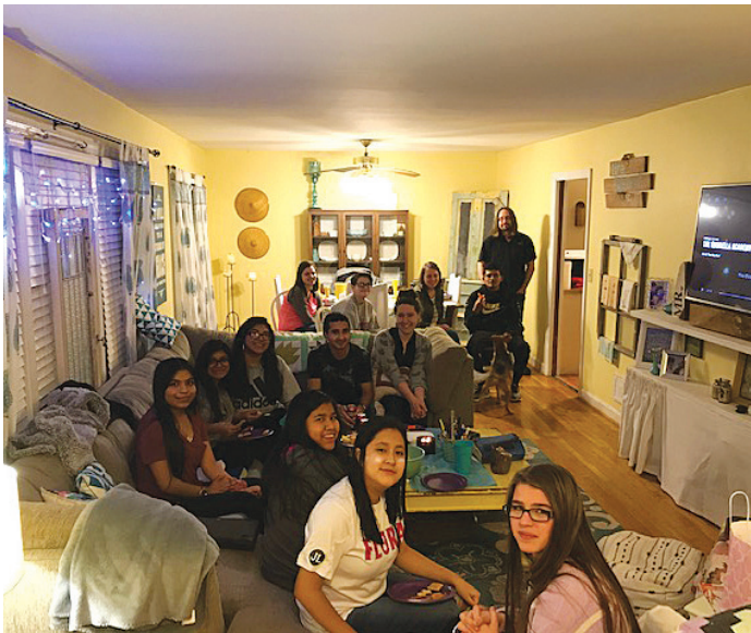
Hispanic High-School ministry