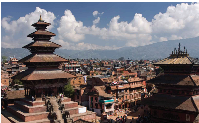
Teaching grace in Kathmandu