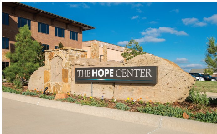
Excited to be at the Hope Center (just behind the rock).

man and committed servant of Christ. He meditated on Scripture constantly.